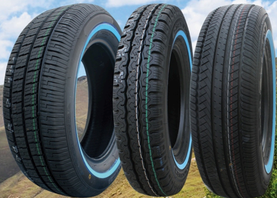
VANTI106 COMMERCIAL512 VANTI306